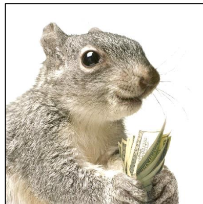
Imagining more Reese's peanut butter cups